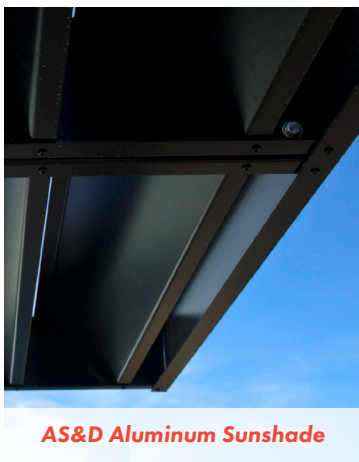
AS&D Aluminum Sunshade