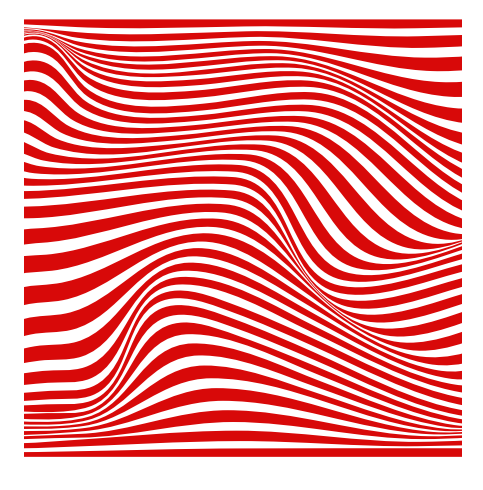
ILLUSION DECEIVING AESTHETICS

Stand out by giving the building a unique personality and attitude.