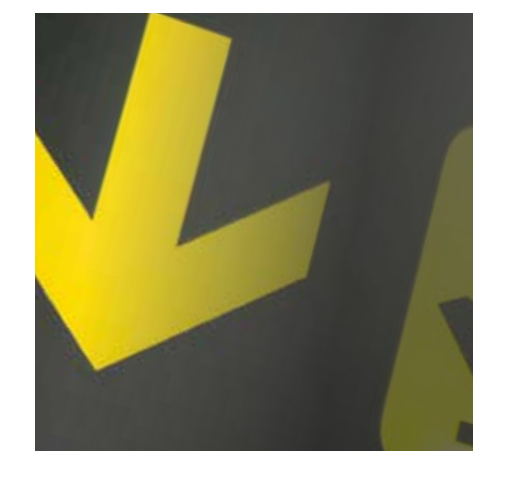
INFORMATION CLEAR MESSAGE

Adapt and add value to your surroundings, by blending in or by adding a new perspective.