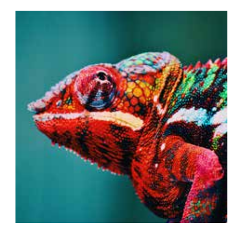
INTEGRATION ADAPTIVE FUNCTION

Adapt and add value to your surroundings, by blending in or by adding a new perspective.