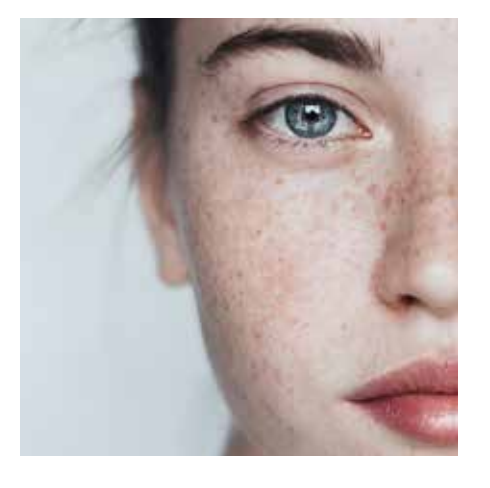
IDENTITY PERSONAL TOUCH

Information helps people make choices. Give a clear message on who, what, where and why.